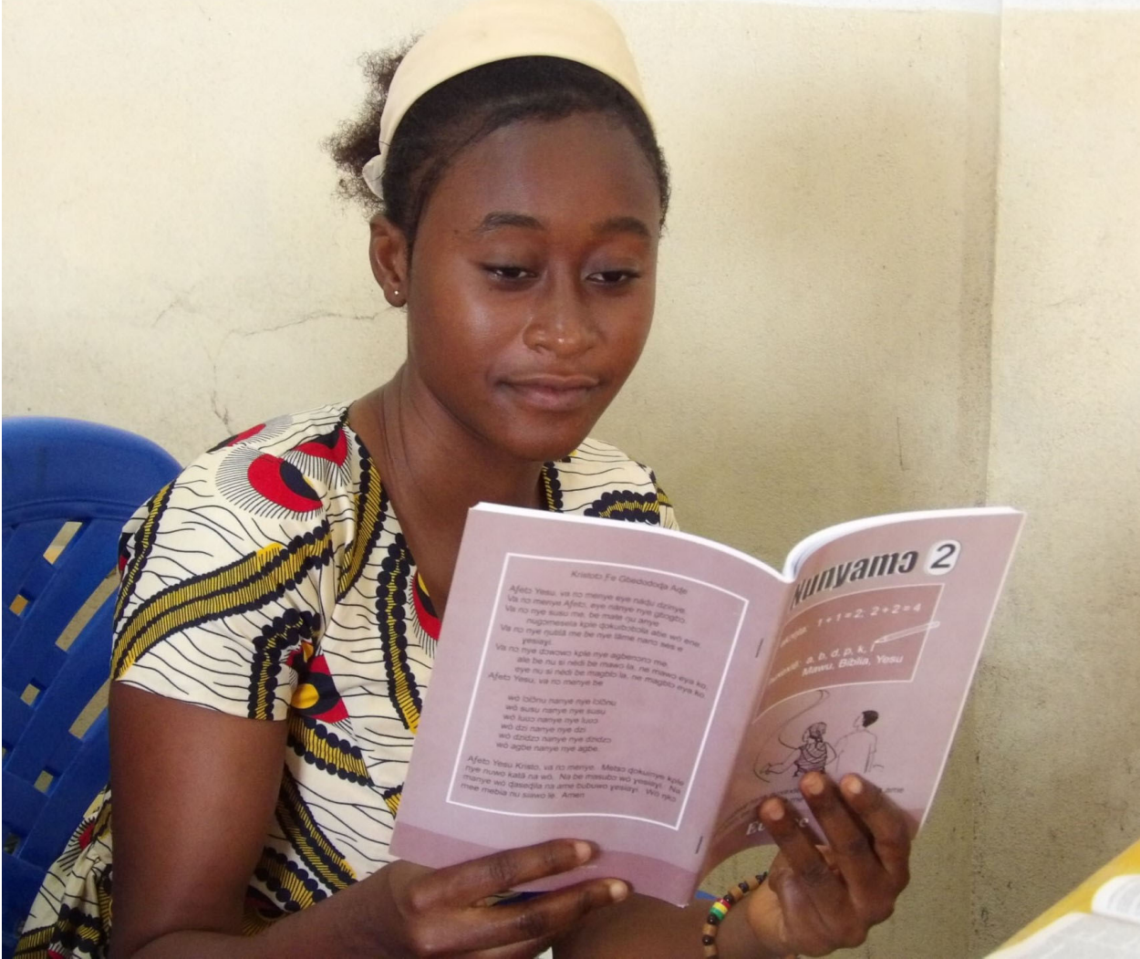
A learner reading the second primer book in Ewe