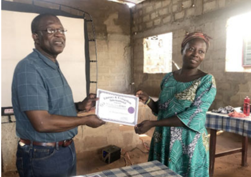
Graduation Ceremony at Tsevie - Togo