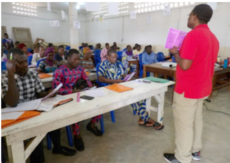
Teachers Training Workshop with Pastors in Baguida

A total of hundred and ten (110) tutors attended the four tutor training workshops. The workshops took place in different places namely: Tsevie I, with 32 participants, Lomé (the capital) with 18 participants, Baguida with 40 participants, and Tsevie II, with 20 participants. After the first two workshops, four trained participants launched literacy classes in their churches and invited me to attend the opening ceremonies. It was amazing! All Glory Be to God!