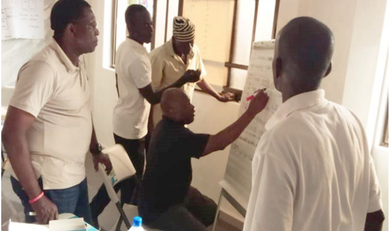
Anufo Primer Construction Workshop in Lome, Togo in November-December 2021

We thank God for the completion of this primer which will help the Anufo people to be able to read the word of God in Anufo. Alleluia! Glory be to God.